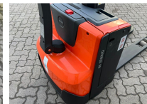
TOYOTA Werksüberholt / Factory refurbished

Price: 3.400,00 € (excl. VAT.) (Subject to prior sale)