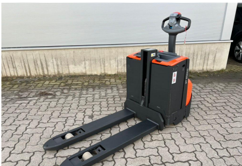
TOYOTA Werksüberholt / Factory refurbished

We expressly point out that the above statements on the device do not represent any represent warranted characteristics. These are to be inquired directly with the responsible salesman in our house However, only the information/properties according to the content of the purchase contract are ultimately relevant.