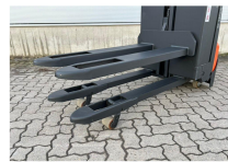
TOYOTA Werksüberholt / Factory refurbished