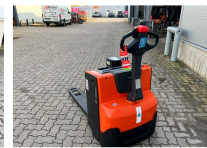
TOYOTA Werksüberholt / Factory refurbished