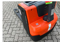
TOYOTA Werksüberholt / Factory refurbished